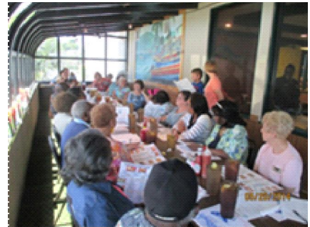
May 2014 – 5 th Grade Essay Winner Is our special guest !