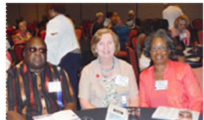
FREA State Convention 2014

[See more photos on our web site: www.nassaufrea.org !]