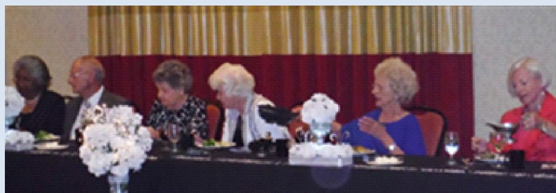
Six Past Presidents of FREA !