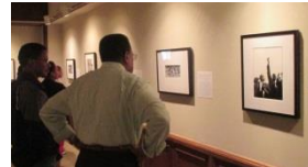
Cummer Museum April Outing

[SEE MORE PHOTOS ON WEB SITE – www.nassaufrea.org ]