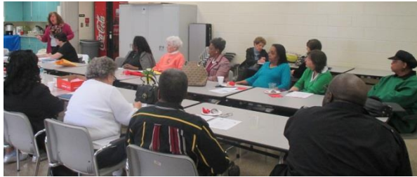
Presentation from Nassau Volunteer Center, January