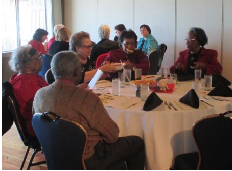
Christmas at Slider's Grill